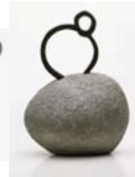
TOMÁS TRENCHARD Dublin, Ireland, February 6, 1979 PEBBLE BAG BAGS PERMANENT COLLECTION SELECTION ONE