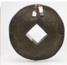
AKIKO TANAKASHI Tokyo - Japan, September 28, 1979 MYJABA MONEY BAGS PERMANENT COLLECTION SELECTION ONE