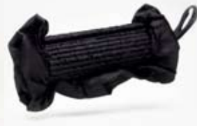
PREMRUDEE LEEHACHAROENKUL Bangkok, Thailand, October 6, 1987 TEMPORARY NIGHT BAGS PERMANENT COLLECTION SELECTION ONE