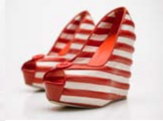
CLAUDIA CIVILLERI Palermo - Italy, January 31, 1966 UP SHOES SHOES PERMANENT COLLECTION SELECTION ONE