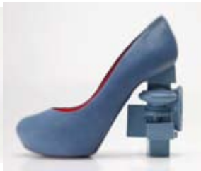
LIZA FREDRIKA ÅSLUND Malmö - Sweden, March 20, 1989 RECYCLED SHOES PERMANENT COLLECTION SELECTION ONE