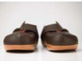
AKAHITO SHIGEMITSU Osaka - Japan, June 15, 1981 POST-MODERNIST SHOES PERMANENT COLLECTION SELECTION ONE

SELECTION OF ARTWORKS FROM THE FIRST CREATIVE CALL